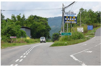
Keep Straight at Jalan Bungaliu (11km to go)