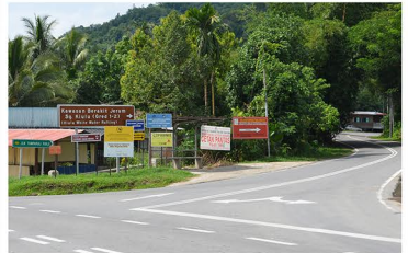
Turn Right at Junction to Kiulu Town (14km to go)