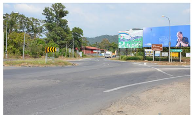
Turn Right at Roundabout to Kinabalu Park (15km to Kiulu Town)